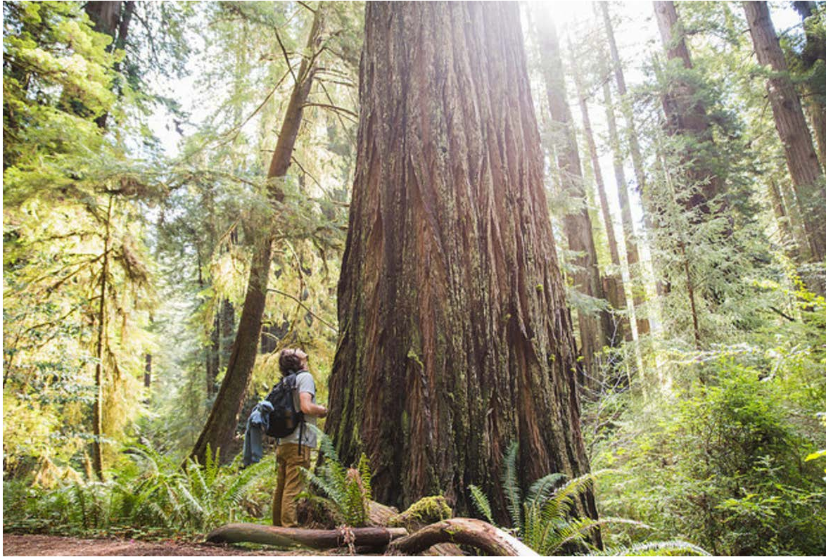
Student engaged in outdoor education in Redwoods