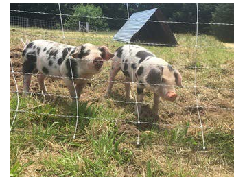
Livestock on the Family Farm