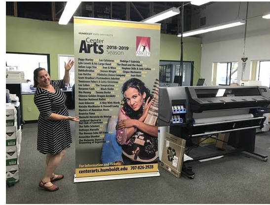
Large Format Pop-up Banner