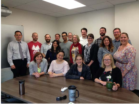
Marketing Services Team