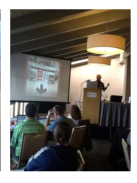
Ruben Pena - Cajon Valley USD