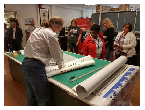
ACUP Welcomes Attendees