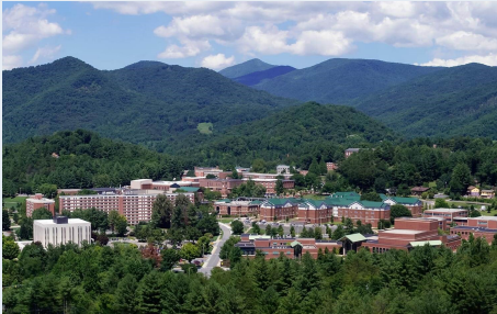
Western carolina University

Purple, purple everywhere. Purple and gold are the school colors for Western Carolina University and it is all over the campus - thanks to the print shop and their amazing staff. It is on signs, banners, buildings, buses and even on the ground. And it is also on students, faculty and employees. They have football, basketball, baseball, softball, volleyball, soccer, tennis, cross county and golf; and the team spirit is palpable. I know, because all of the attendees at the SUPDMC conference were bussed over for a tour of their in-plant print operation.