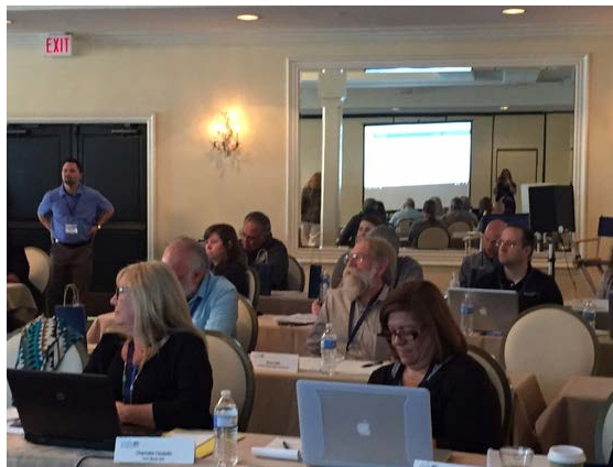
Everyone had great enhancement ideas to share