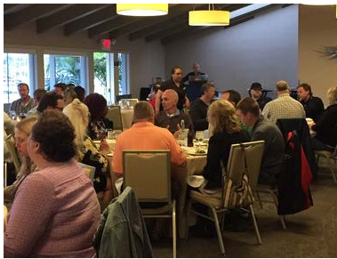
Dinner at the Sunset Room with a view of the marina was a hit

Our evening events provided plenty of time for networking and sharing print shop stories. New friendships were made and emails and phone numbers were being exchanged so that the relationships that were developed could continue.