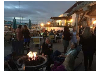
A beach bonfire kept everyone out late

Our evening events provided plenty of time for networking and sharing print shop stories. New friendships were made and emails and phone numbers were being exchanged so that the relationships that were developed could continue.