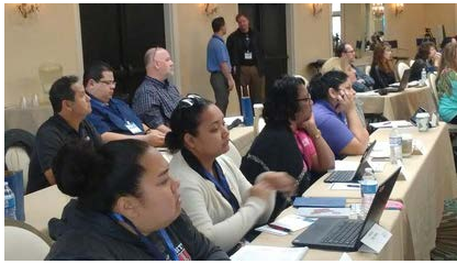
Classroom presentations get everyone involved